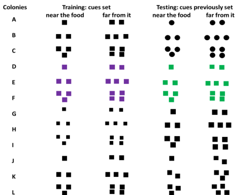
Figure 2. Cues (numbers of elements) presented to the ants, during training and testing

After 7, 24, 31, and 48 training hours, the ants were tested in a separated tray (21cm x 15cm x 7cm). the borders of which having been slightly covered with talc to prevent escaping. Each tray contained two stands bearing cues differing by one characteristic from those presented during training (see below) and set at about seven centimeters from one another (Figure 1, lower right part; Figure 3, the lower photo for each colony). To make a test, 25 ants of the experimented colony were transported into the tray devoted to testing and the ants approaching each of the two stands at a distance of at most 2cm were counted twenty times over ten minutes (Table 1). The twenty counts relative to the two cues allowed establishing the ants' proportion of correct responses (i.e. the ants' responses to the number of elements identical to that set near the food during training), a proportion given only in the text. The numbers of elements corresponding to those presented during training were randomly located on the left or on the right in the tray devoted to testing. After each test, the ants were immediately returned into their foraging area, very near their nest entrance. After having made the four tests (i.e. after 7, 24, 31, and 48 training hours) on a colony, the average of the ants' conditioning scores (% of correct responses) was calculated (Table 1, last column).