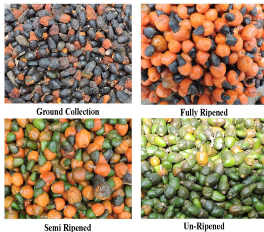
Fig. 1. Seed maturity indices of Semecarpus anacardium

through physical indices such as size, colour and weight, which are much useful in perennial crops [11] as seed collection is mainly from ground than from the tree due to difficulties faced on climbing the tree for selection of fruit. Researchers (In Jatropha curcas , [12] in Neem, [13,14], in Simaruba [15]; in Calophyllum inophyllum (Punnai), [16] revealed that fruit colour serve as an indicator of seed maturation in tree crops as it is easily identifiable and applicable and the results are also highly reproducible and also suggested collection of fruits based on fruit colour could as an reliable index of seed maturation and for selection of quality seed for raising plantation [17]. Hence, the present study was undertaken to know the influence of seed maturity indices on germination of Semecarpus anacardium .