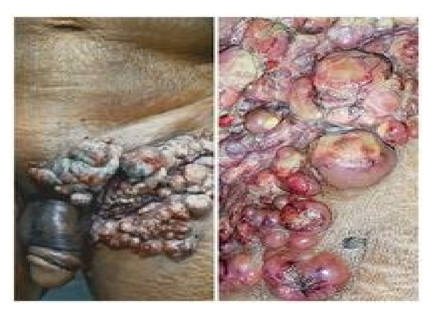
Fig. 1. Multiple violaceous cutaneous nodular lesions over the left inguinal and pubic region

On examination, his general condition was poor. He was dehydrated and pale. Vitals were stable. The left lower limb was swollen with pitting edema along with penile and scrotal oedema. There were multiple violaceous, firm nodules with secondary infection over the left inguinal region, left upper thigh (anterior and medial aspect) and pubic region. An approximately 5 x 5 cm fixed inguinal lymph node was palpable. Suprapubic fullness was present. The rest of the abdominal examination and other systemic examinations were normal. Digital rectal examination revealed a grade II enlarged prostate which was firm and non-tender. No hard nodules were detected. The median sulcus could be palpated. Rectal mucosa was normal and there was no blood staining of the examining finger. The anal tone was normal and the bulbocavernosus reflex was normal. The patient was catheterized.