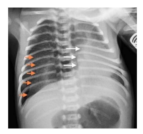
Fig. 1. Anteroposterior projection of thorax x-ray pre-chest intercostal drainage Orange arrows showing a right pleural line (border between avascular radiolucent and the lung parenchyma); White arrows showing mediastinal shift

Annas et al.; AJCRS, 9(3): 17-21, 2021; Article no.AJCRS.68278