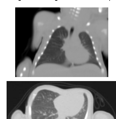
Fig. 3. Thorax contrast CT scan post removal of the chest intercostal drainage There are no visible features of atelectasis, pneumothorax, or pneumomediastinum on CT, no visible mediastinal, hilar, or tracheobronchial lymphadenopathy. There is no visible picture of obstruction, narrowing, or dilation in the tracheobronchial system; The shape and size of the cor are normal