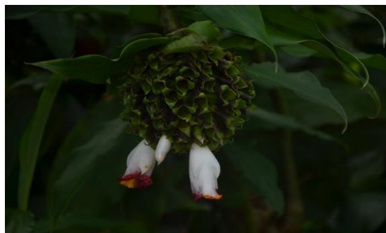
Plate 1. Costus lucanisianus

Biology, Federal University Otuoke, Bayelsa State, Nigeria.