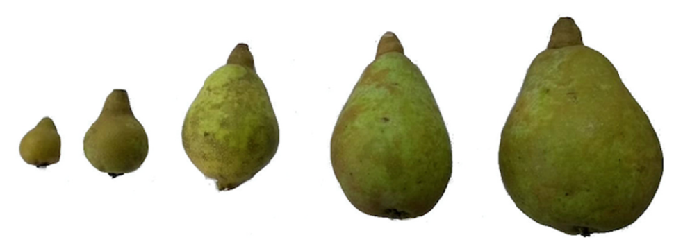
Figure 1. Different stages of development of pear fruits of cv. 'Triunfo' used for modeling

128 fruits were collected from all stages of development (Figure 1) in three different seasons: September 2018; January 2019 and March 2019. The fruits were packaged and transported to the laboratory where they were measured at maximum length (L) and maximum width (W) (Figure 2), as a digital caliper (Fowler<sup>®</sup>), in millimeters. The observed mass (OM, in g) of each fruit was also obtained with an electronic precision scale (MARTE<sup>®</sup>).