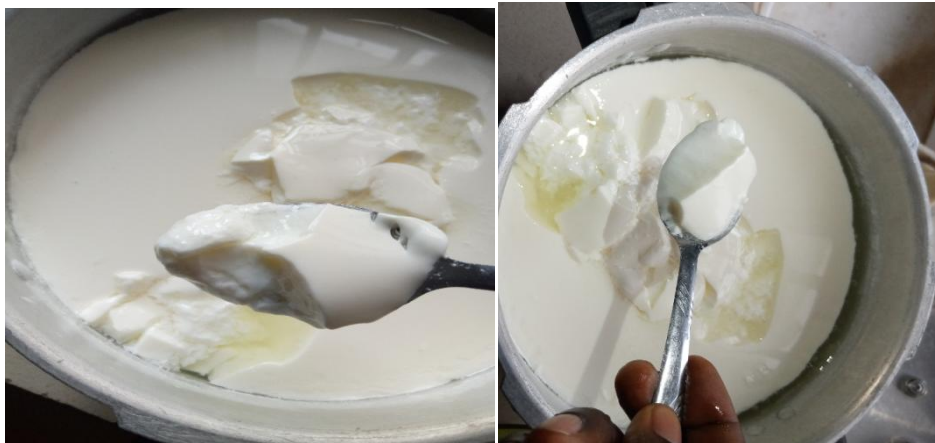
A. Soft, smooth, pudding-like, firm textured product- consistent throughout back sloping batches