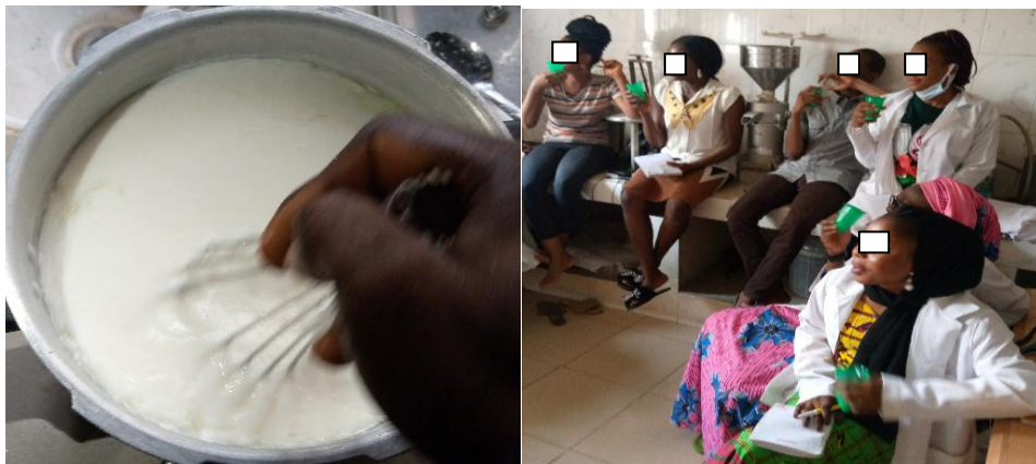
B. Smooth-and-creamy Product