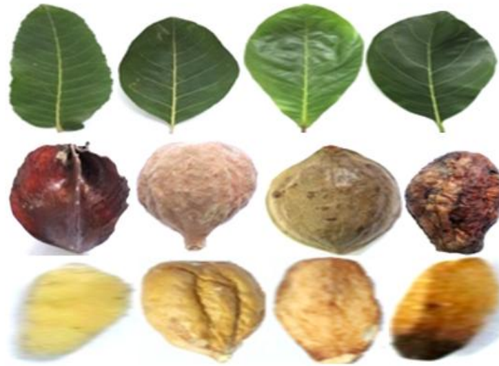
Fig. 1. T. arjuna , T. billerica , T. cattapa and T. chebula (from left to right) leaves, seeds and kernels (from top to bottom)