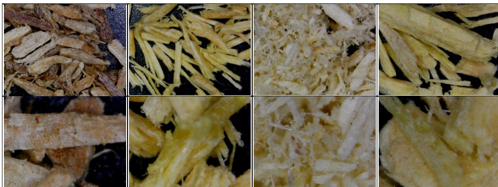
Fig. 2. Micrographs of T. arjuna , T. billerica , T. cattapa and T. chebula (from left to right) leaves samples at 50× (upper row) and 500× (lower row)