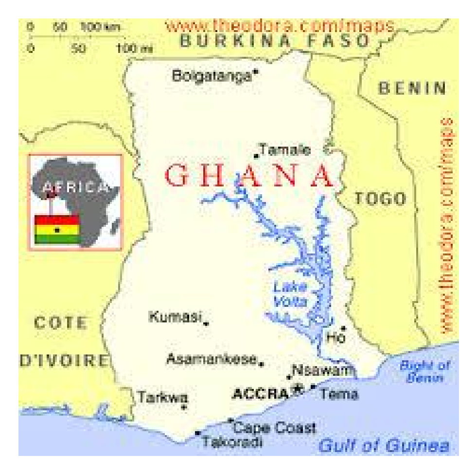
Fig. 1. Map of Ghana showing some of the neighboring countries