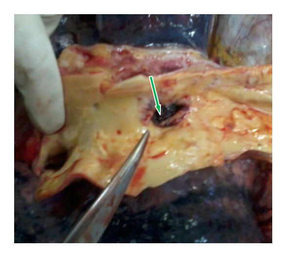
Fig. 2. Close-up view from aortic side

A 61-year-old male had complained of loss of appetite and dysphagia for over two months. He had undergone an upper GI endoscopy in a state sector tertiary care hospital one early morning and had been discharged the same afternoon. He developed chest pain and haematemesis the same evening at home. He collapsed on the way to hospital and was pronounced to be dead on admission. Post mortem examination revealed pale conjunctivae, pale organs, flame shaped sub-endocardial haemorrhages on the left ventricular wall and un-clotted blood in the stomach (approximately 650ml in volume) but no evidence of melena. Esophageal mucosa was free of acute injury and no evidence of ruptured esophageal varices was found. An ulcerative lesion of the upper esophagus measuring 3.8 cm x 3.5 cm with a fistula tract connecting the esophageal lesion with the superior part of the descending aorta was evident (Figs. 1 and 2). The thoracic and to a larger extent the abdominal aortic intima was studded with fissured, calcified and ulcerated atheromatous plagues. They were present around the fistulous connection on the aortic side. Both renal artery openings as well as the renal arteries themselves were extremely narrowed with complicated atheroma. Both kidneys appeared granular and contracted. There were more than 90% atheromatous narrowing of all three major coronary artery branches. The cause of death was given as haemorrhagic shock following aortic aneurysmal rupture into oesophagus.