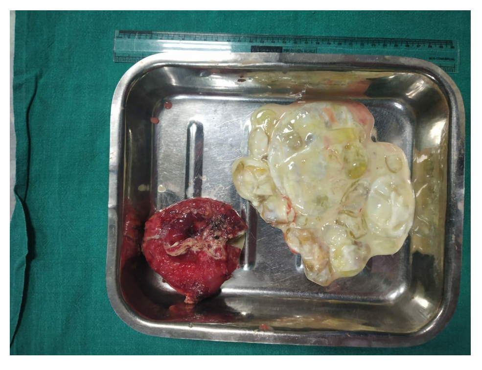
Fig. 3.Gross examination of specimen revealing multiple daughter cysts