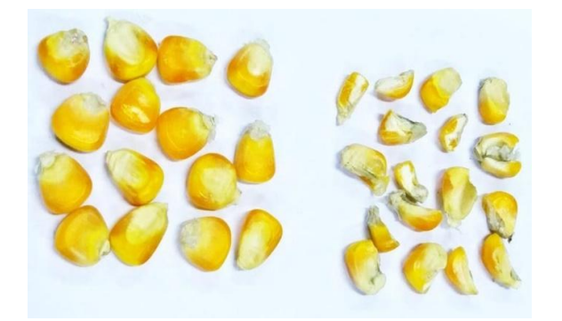
Fig. 3. Appearance of the grain after drying

Drving is a major operation in the agricultural and food industry. It is often used as a primary operation for preservation of food materials, or as a secondary process in some manufacturing operations. Drying, a higher energy-consuming process, is also often practiced in the industry using direct thermal energy from the sun or driers and ovens. From the viewpoint of preservation of energy, it is desirable to store food at ambient conditions. This can be achieved by drying operations which reduces moisture content and water activity to prevent spoilage under long-term storage conditions. Key benefits of drying are an increased shelf life and a reduction of product volume and weight, which facilitates easy storage and transportation.