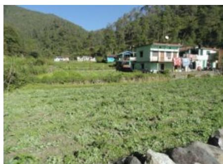
(b) Backyard and side home garden