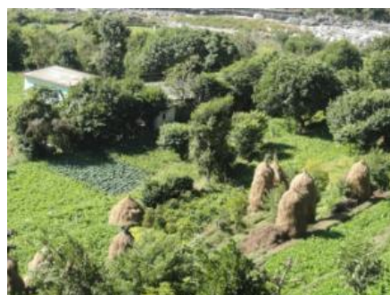
(d) Large home garden