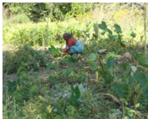
iii. Digging (harvesting) Colocasia