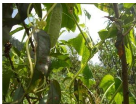
(f) Cucumber vine on fruit tree