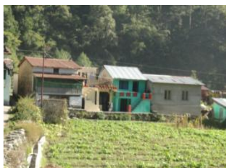
(a) Front yard home garden