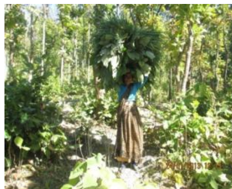
iv. Collecting fodder for livestock