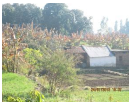
(e) Banana tree in home garden